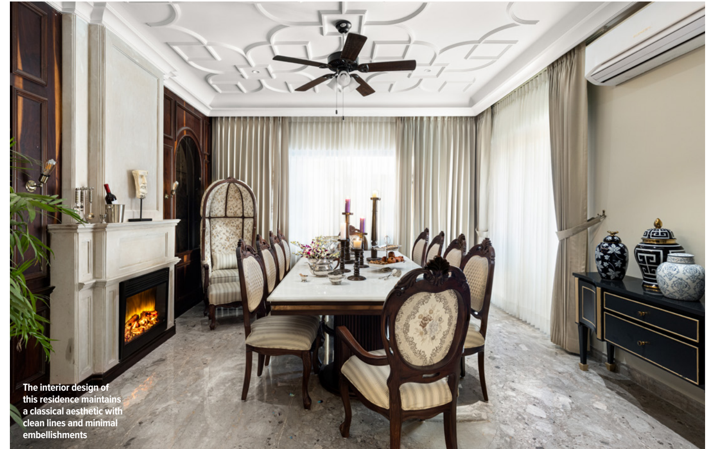
The interior design of this residence maintains a classical aesthetic with clean lines and minimal embellishments