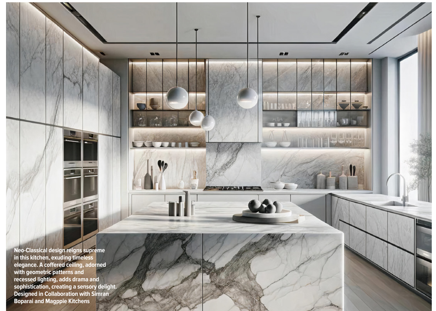
Neo-Classical design reigns supreme in this kitchen, exuding timeless elegance. A coffered ceiling, adorned with geometric patterns and recessed lighting, adds drama and sophistication, creating a sensory delight. Designed in Collaboration with Simran Boparai and Magppie Kitchens